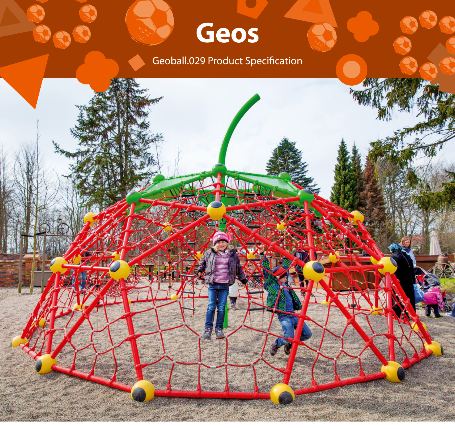
Published: November 2019