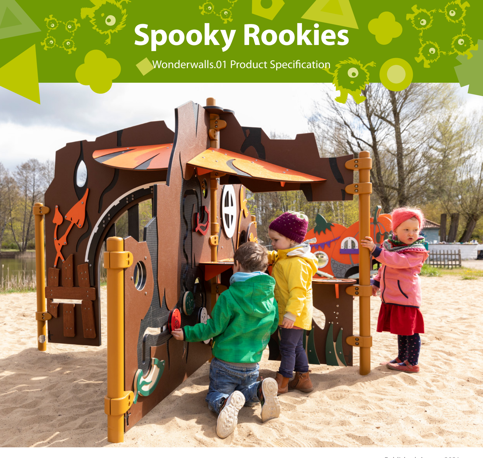
Published: August 2021