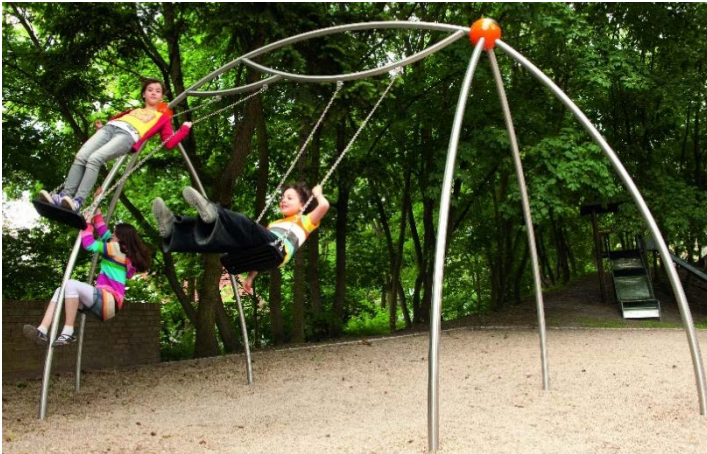
Swingo.2.4 The large two-bay-version of the Swingo combines asymmetry and high-flying-dynamics. Cool game – cool look!